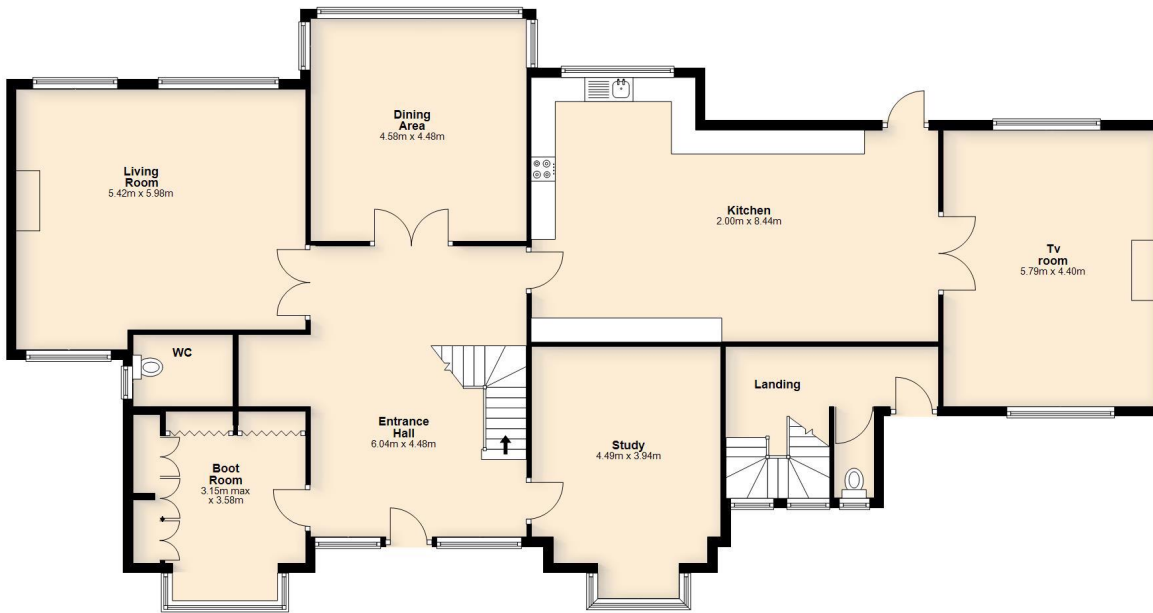
Ground Floor Approx. 197.3 sq. metres